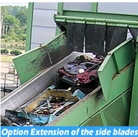
Option Extension of the side blades