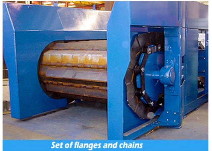
Set of flanges and chains